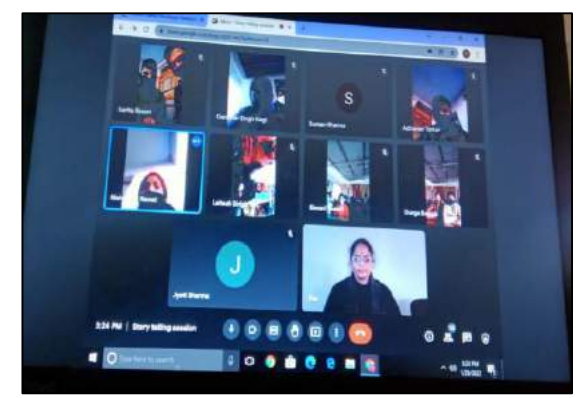
Flying Birds children joining online Story-Telling