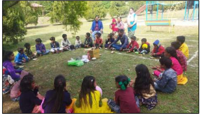
On 15 November, the students of Himalayan College of Nursing, Swami Rama Himalayan University conducted various activities including a health screening session with the children in Flying Birds.