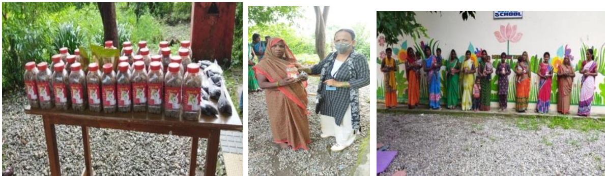
Parents of the children receiving Ayurvedic kits

To meet the nutritional needs of the children, 50 ayurvedic kits were distributed for the children in the community.