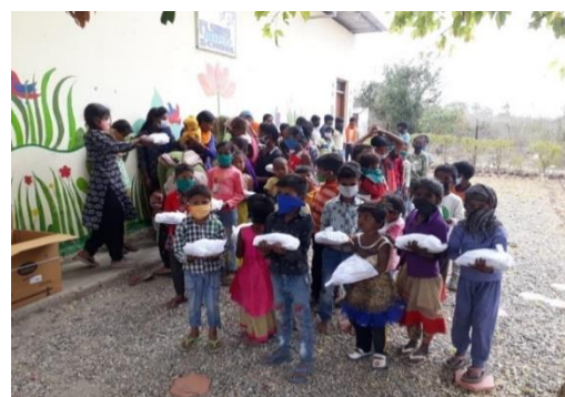
Packed Lunch distribution