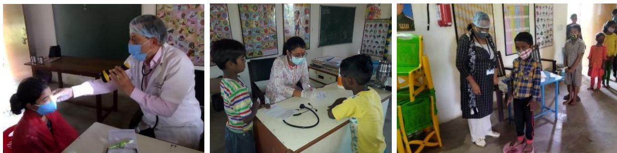
Health Camp in Flying Birds

One specific maternal and child health camp was also conducted for the women of the community. The women from the community sought consultation for their health issues from the doctor.