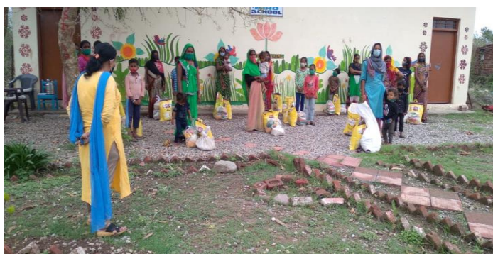
Monthly Food Kit distribution

As the provision of regular mid-day meal was on hold due to closure of the school, Food kits were distributed to the children to cater their food needs. Children received Food Kits which contained all the necessary food items in the quantity that was sufficient for one month during entire year.