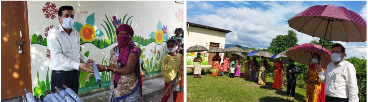
Children's families receiving umbrellas

Umbrellas were distributed to every family in the Flying Birds community. Total 25 families received umbrellas which made them very happy as this was a much-needed item for the rainy season.