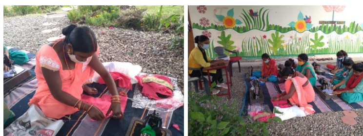
Women and girls learning tailoring skills

Bella tailoring program continued training the women and girls of the community. Some of the trainees started from the basic level however some already had basic knowledge and skills on tailoring. The trainees were also engaged in mask making. From May to September, the