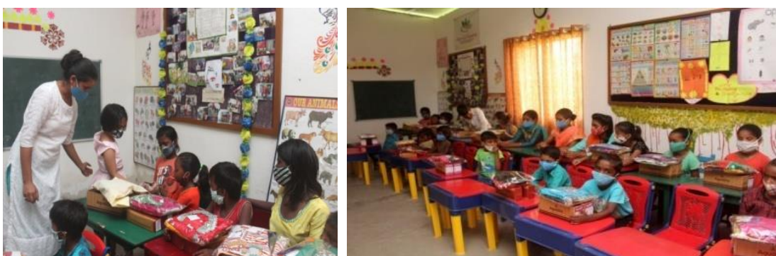
Clothes and slippers distribution

On 11 August 2021, clothes and slippers were distributed to children. Total 23 children received the seasonal clothes and slippers.