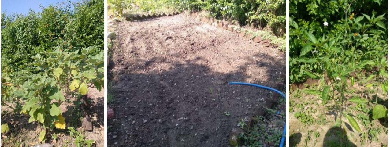
Flying Birds' green comound

A clean and green school compound plays an important role in children's growth and development and improves quality of learning. Flying Birds and the entire campus of RDI-HIHT also maintains the same and always strive for having an ecofriendly campus.