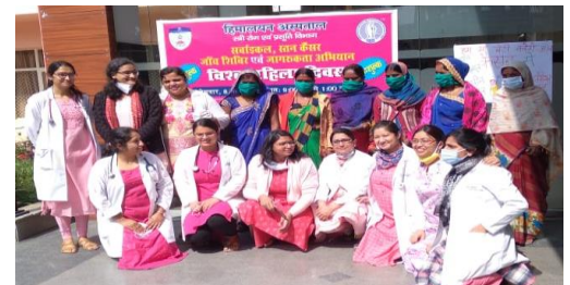
Women Checkup at Himalayan Hospital

On 8th March, International Women's Day was celebrated at school in which women from the Labour Basti community were invited and given opportunity to join the online program conducted by RDI. Health checkups were also facilitated for 9 women at Himalayan Hospital. All the tests were done free of cost.